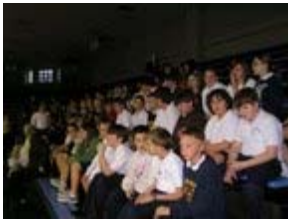
Sts Peter and Paul School