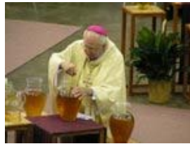
Mixing the Chrism