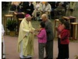
Sts Peter and Paul