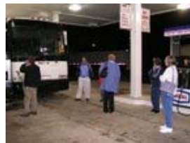
Awaiting rescue on the way home